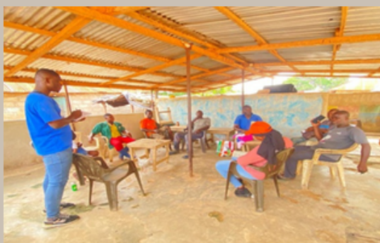
Focus group discussion with local communities

Although management policies exist, their implementation remains weak due to limited enforcement and low community participation. This limits their effectiveness and highlights the need for participatory governance and improved monitoring.