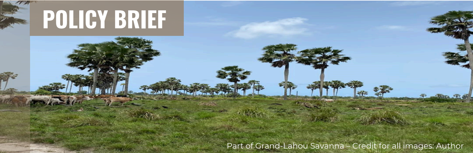
Part of Grand-Lahou Savanna