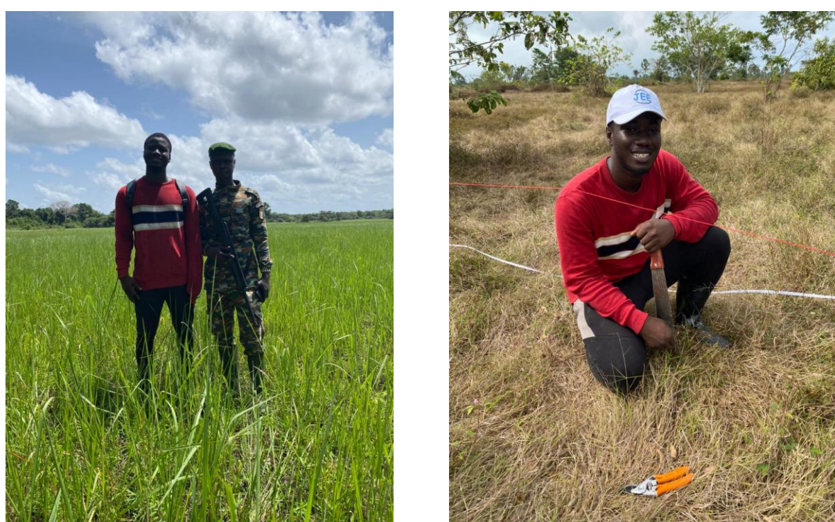
Figure 1: Photographs illustrating field activities.