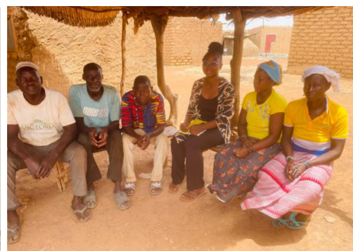
Focus group discussion