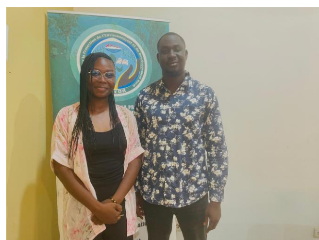
Key informant interview